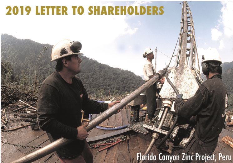
Florida Canyon Zinc Project, Peru