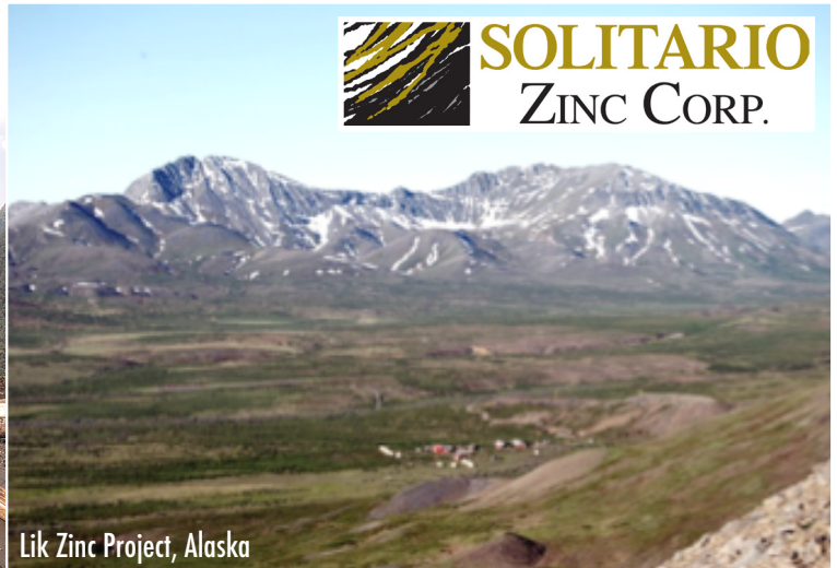
Lik Zinc Project, Alaska